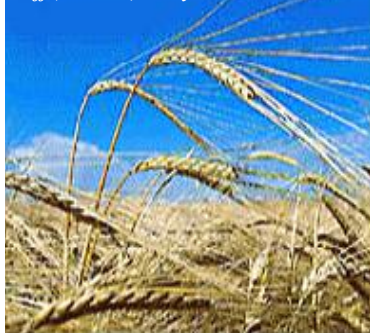
Stiff (stubborn) barley was broken