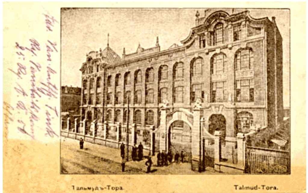
Torah Academy at Lodz, Poland, 1915. Torah education and training commences at youth.

Your requirement for "independent contemporary evidence" is an internally flawed request: this position claims that a single, historical account - even if held by millions of people - is insufficient evidence for the history it claims. So what IS sufficient for your standards? You suggest additional accounts from independent sources. However, what would these "independent sources" add, other than numbers of