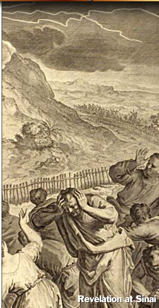
Revelation at Sinai

As I see it, a majority of these proposed solutions can only be taken seriously if we first take the