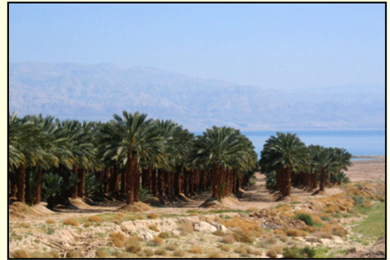
Desert to Dessert Israelis grow orchards of date palms in barren areas

We would like to point out two other aspects of V'chivshua, a national and personal one. With the Divine creation of the State of Israel, the Jewish nation has been privileged to be involved in national Kibbush. Harnessing and developing the latest cutting-edge technology in areas such as agriculture, economy, military, etc., as we rebuild our homeland, is national Kibbush. Making the arid desert bloom with a dazzling array of colors, and jamming the most sophisticated radars in the world while destroying our enemy's nuclear capabilities are two stunning examples of this glorious national Kibbush.