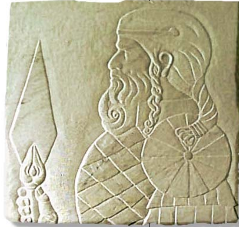
King Saul had numerous innocents killed due to Doeg’s Richiluss

This verse in Psalms commences with “God”. Why is this so? Many verses in the Torah that cite evildoers merely address the evil, and God is not mentioned in the verse. I