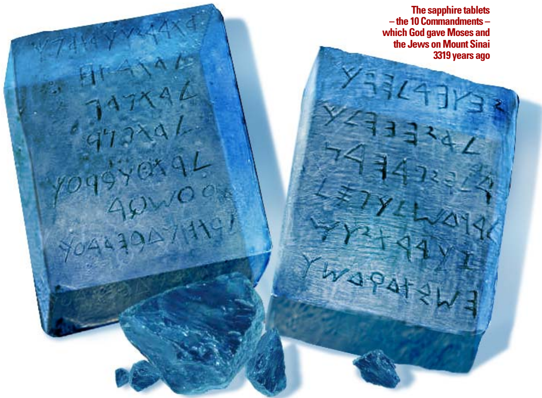
The sapphire tablets – the 10 Commandments – which God gave Moses and the Jews on Mount Sinai 3319 years ago

Judaism: the only religion based on proof – not blind faith. The only religion where masses witnessed God’s revelation and transmitted those miraculous events. Had Revelation at Sinai never occurred, the Jews would not have transmitted it as their history, in place of truth. They would not have accepted a Moses seeking to convince them, of what they had not experienced. But the Jews did transmit this event. Sinai took place. We possess God’s word. How fortunate we are.