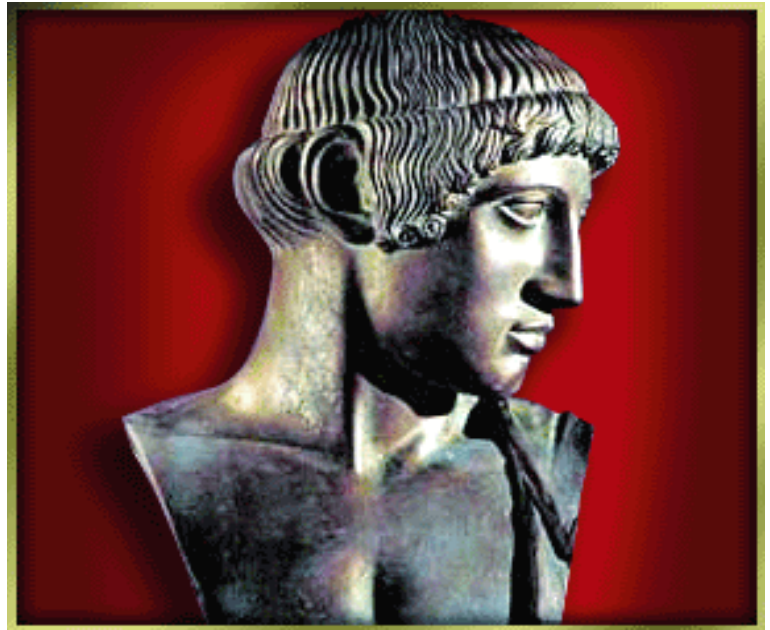
Interesting dichotomy: Greeks were intellectuals, but believed in Apollo and other deities

Following is a reader's response to our article "Does Idolatry Work" printed in last week's JewishTimes. In that article, we quoted Tractate Avoda Zara 55a deriving two principles from two cases; Case 1) a cripple "simultaneously" healed while praying to his wooden god, or Case 2) rain falling in "response" to idolaters' compliance with their godly commands in a dream. We stated that these are in fact nothing but coincidence, and falsely assumed cause and effect relationships, respectively. In Case 1, the healed idolater is nothing more than a coincidence with his idolatrous prayer. In Case 2, rain that falls immediately after an idolatrous practice, cannot be in "response" to idolatrous practices. The reason the Jew recorded in the Talmud had questioned the truth of such phenomena was due to his false sense that a relationship exists between two events that occur, either simultaneously, or subsequently. When phenomena coincide or appear in subsequent fashion, man is usually correct, and there is a relationship. But this cannot be the case when when we see phenomena occurring while idolatrous rites are performed. In such cases, there is no relationship between two events, except for the imagined relationship an idolater projects.