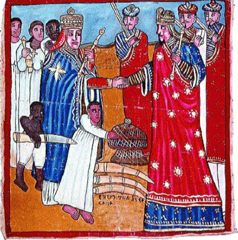
The Queen of Sheba offering King Solomon gifts - awed by G-d's wisdom