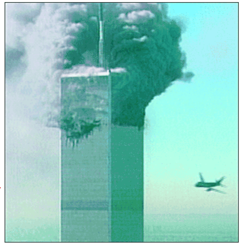
The tragic result of man-made religion

Perhaps also, some other religions may, for a moment, lay down their swords and ponder an idea or two. However, only if ideas are presented undiluted, will they be afforded the opportunity to see the truth.