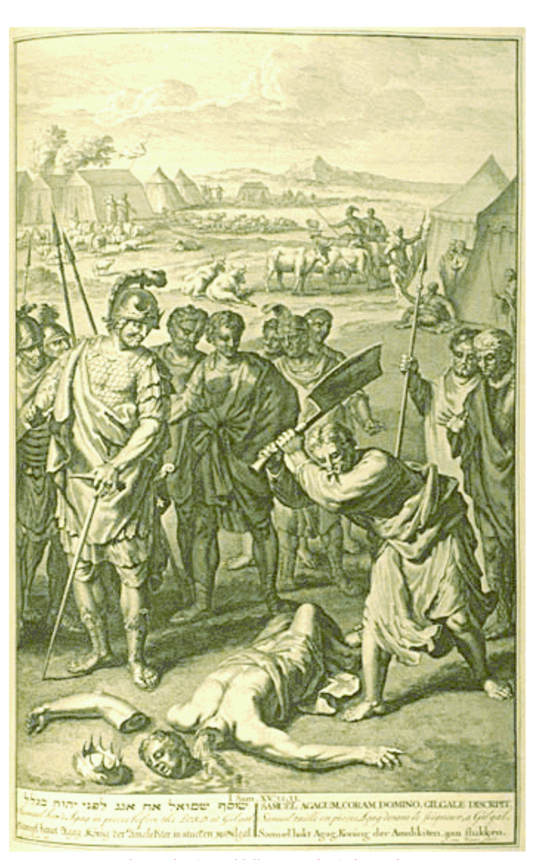
The prophet Samuel killing Agag by G-d's word

Society must be secure from evil for it to function properly - as a haven for Torah study and practice. This applies to both Jew and Gentile, as there is but one Torah system for both - although various laws apply to just the Gentile, just the servant, just the woman, just the Levite and just the Israelite.