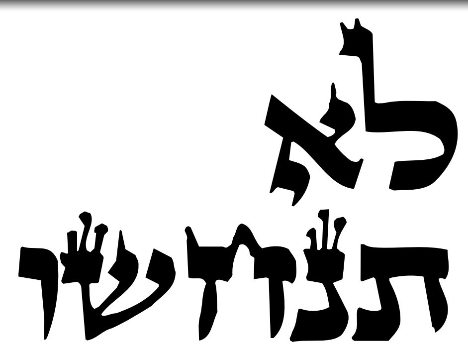
Read God's Torah. It was "written" so that it should be read— not ignored in favor of what the masses follow. God made it quite clear: "do not make signs". Additionally, they don't work.

Maimonides admonished foolish people who look to the mezuza for physical protection. (Hilchos Mezuza, 5:4). There, he calls such people fools for seeking protection. He states that they take a command, which is in fact for the