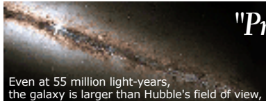
Even at 55 million light-years, the galaxy is larger than Hubble's field of view,

"Praise Him sun and moon, praise Him all bright stars.... for He commanded, and they were created."