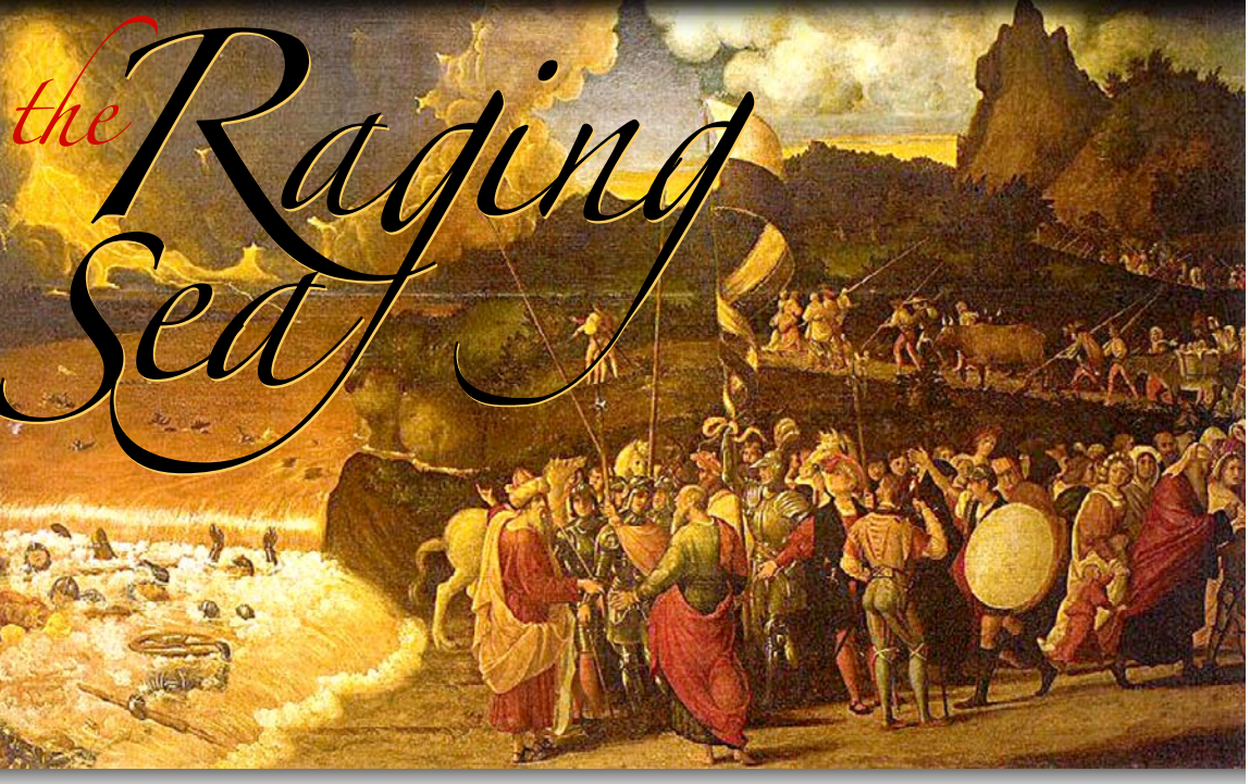
RABBI MOSHE BEN-CHAIM

ell not actually raging, but it was "upset". Last week we discussed Lashon Hara, bas