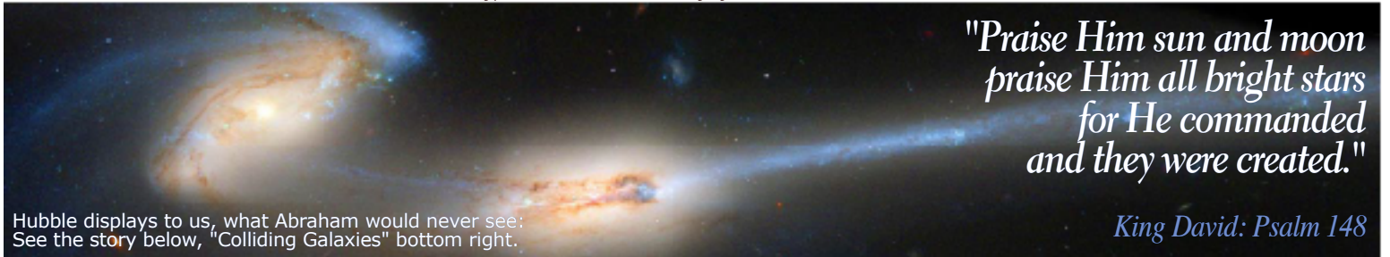
Hubble displays to us, what Abraham would never see: See the story below, "Colliding Galaxies" bottom right.

"Praise Him sun and moon praise Him all bright stars for He commanded and they were created."