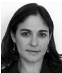
Caroline Glick is an American-born Israeli journalist, newspaper editor, and writer. She writes for Makor Rishon and is the deputy managing editor of The Jerusalem Post.