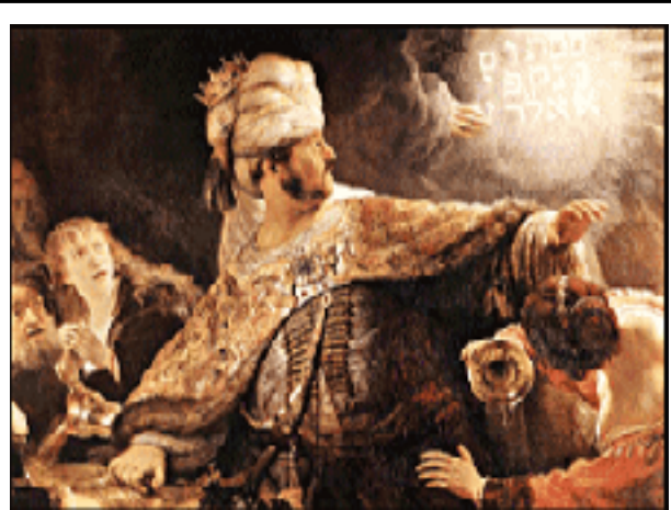
Belshatzaar witnessing the miracle of a hand writing on the wall.