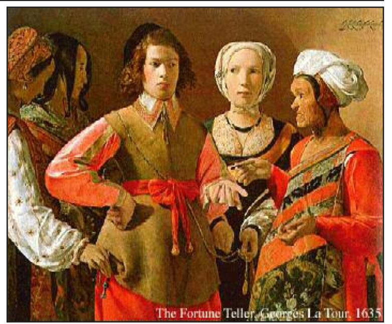
Heathen practices of fortune telling - a major theme in this week's parsha

The concept of a poresh must have greater significance than simply abstaining. Pure abstention infers that the person is withholding something from himself. This would imply that the person really has the desire to do the prohibited action but he is just controlling himself. Such an idea would be nothing more than an