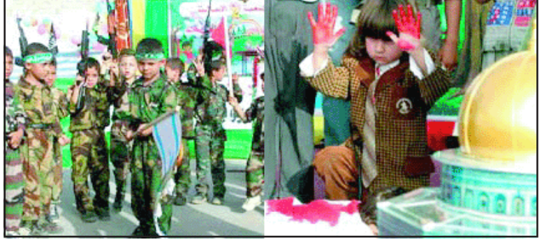
During a recent graduation ceremony of the kindergarten class at the Islamic Charity Foundation in Gaza, young children were encouraged to dress in camouflage fatigues, to march with toy machine guns and to burn the Israeli flag. Some students were made to pose with red paint on their hands, representing blood, or to imitate leaders of terrorist organizations such as Hezbollah while repeating virulently anti-Israel and anti-Semitic statements.

The Arab Muslim culture is not being changed. It will continue its downward spiral as a people favoring ruthless terrorism, and the obliteration of life. These deviant and cruel animals drench nails in rat-poison, that tear through human limbs, hurled with explosives so powerful that heads are ripped off bodies. The Arabs will