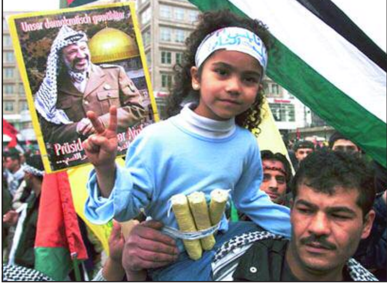
| Arabs teach children one goal: Kill Jews with your own life. You cannot talk peace with them. Period.