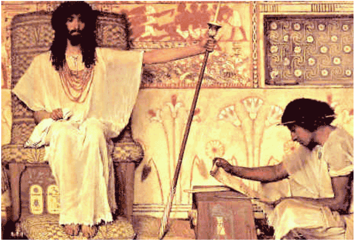
loseph's position as the granaries' overseer forced everyone, (specifically his brothers) to confront him for food. All planned by Joseph to direct their repentanc

Yehudah completes his appeal. Yosef is overcome with intense emotion. He commands his servants and ministers to leave him. He is